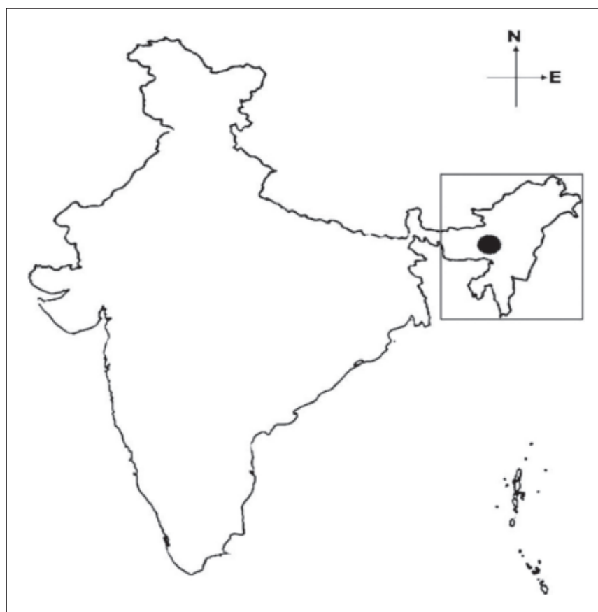
Figure 1. Map of India showing geographical location of Guwahati city (denoted by black dot) in northeast region of India.

* Source: State Health Directorate of Assam, India