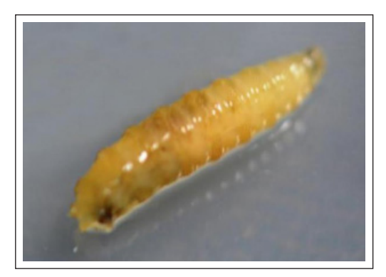
Figure 1. Third Instar larva of C. bezziana extracted from wound.

The larvae were creamish white, 12–18 mm long, worm like gradually tapering at the anterior end (Fig. 1). The anterior spiracles were plamate in shape each being composed of 4-6 lobes arranged in a single row located at dorso-posterior margin on each side of prothorax (Fig. 2a). The posterior spiracles consisted of three oblique slits encircled by dark thick peritreme that is incomplete ventro-medially around the compressed button (Fig. 2b). The cephalopharyngeal skeleton comprised of a pair of long, curved and stout mouth hooks with prominent dorsal arch and dorsal cornu. The ventral cornu is narrow, deprived of an apperture called