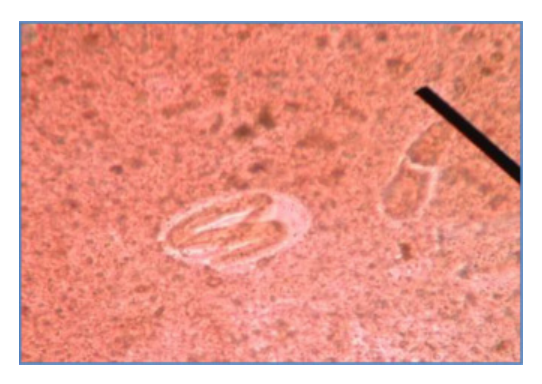
Figure 1. Egg of S. stercoralis in eosin staining direct examination

Table 3. Immunocompromised condition associated with S. stercoralis infection