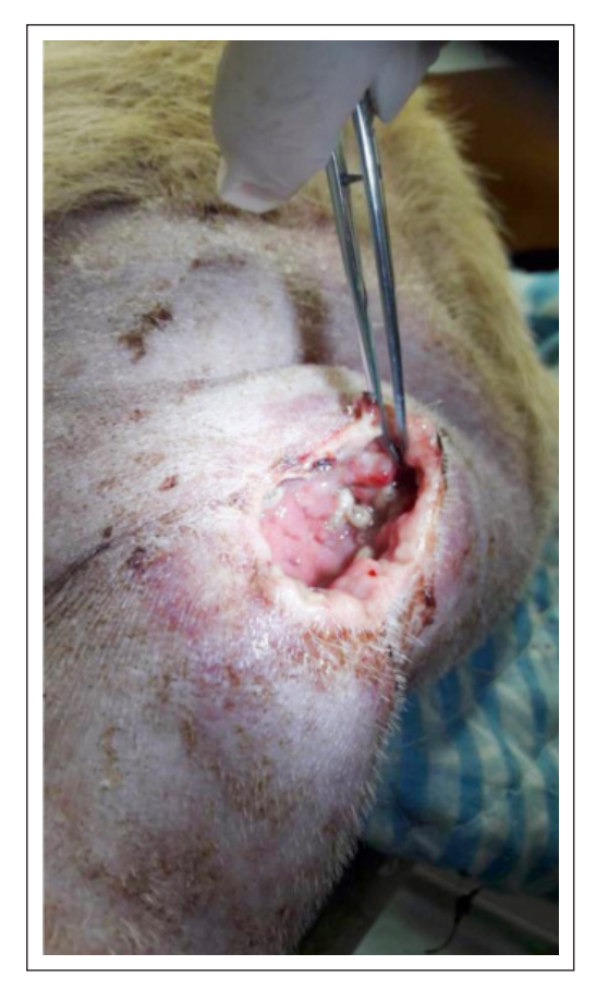
Figure 1. Clinical view of cutaneous myiasis wound in dorsal sacrococcygeal area of the adult dog (case 1) infested with ~100 fly larvae.

Faculty of Medicine, Chiang Mai University for species identification. After removing the larvae, the dog was treated with 7.0 mg of amoxicillin, 1.75 mg of clavulanic acid (Synulox<sup>®</sup> RTU) and 1.675 ml of dipyrone (NOVACILAN<sup>®</sup>) for skin and soft tissue infection, subcutaneously (dose 1 ml per 20 kg body weight) and intramuscularly (dose 25 mg/kg) injected as an analgesic and antipyric, respectively. In the treatment plan, the owner took the dog to remove the larvae, clean the wound and inject medicinal drugs every day for wound healing within 4 weeks.