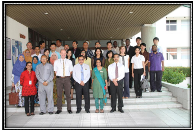
The participants for MSPTM Mid-year Seminar