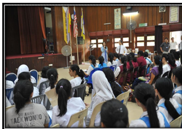
The participants listening to the talk