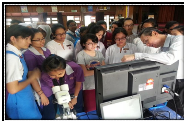
Students at the exhibition booth

The session was complemented with the live specimen exhibition of the incriminated dengue vectors, Aedes aegypti and Aedes albopictus mosquitoes from Medical Entomology team, IMR as well as the parasites specimens from the collection of the Veterinary Parasitology Laboratory, Faculty of Veterinary Medicine, Universiti Putra Malaysia. A video presentation on Forensic Entomology was also played during the short course.