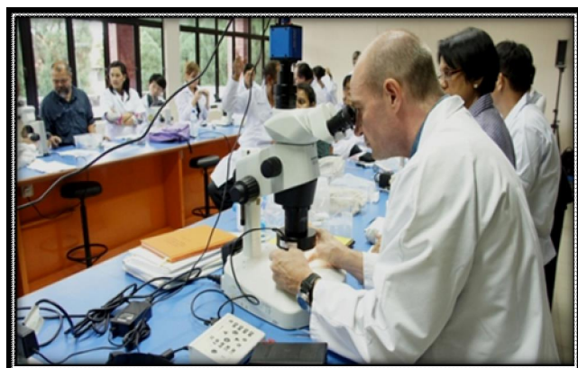
Identification of the collected flies