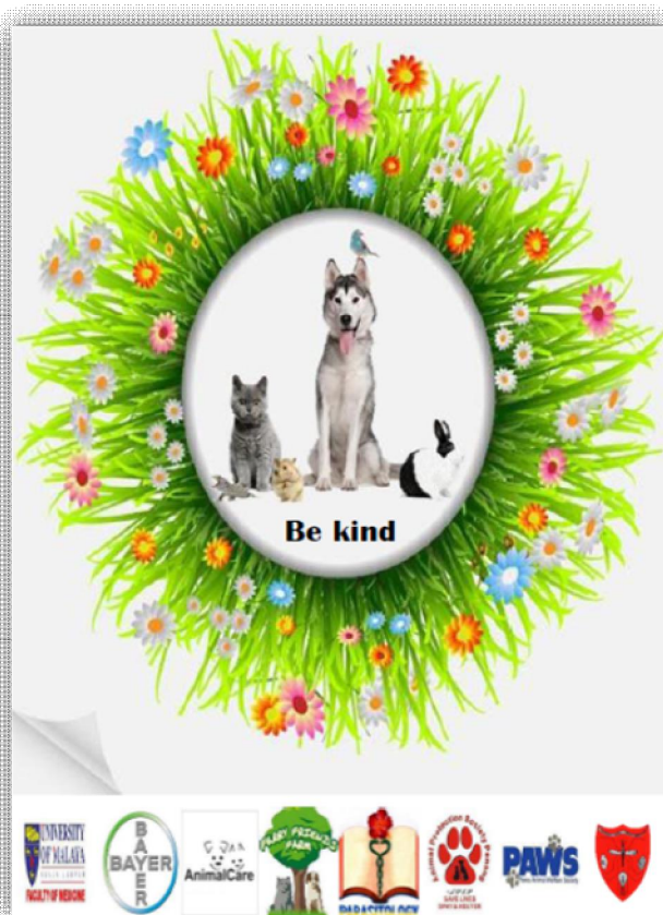
A charitable event to raise medical fund for AnimalCare Society

In conjunction with the World Animal Day on October 4 th every year, an Animal Awareness Day 2013 was held on 17 th October 2013 at Centrepont, Faculty of Medicine, University of Malaya.