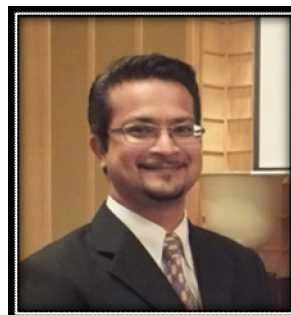
President's Message 49 th MSPTM Council 2013/14