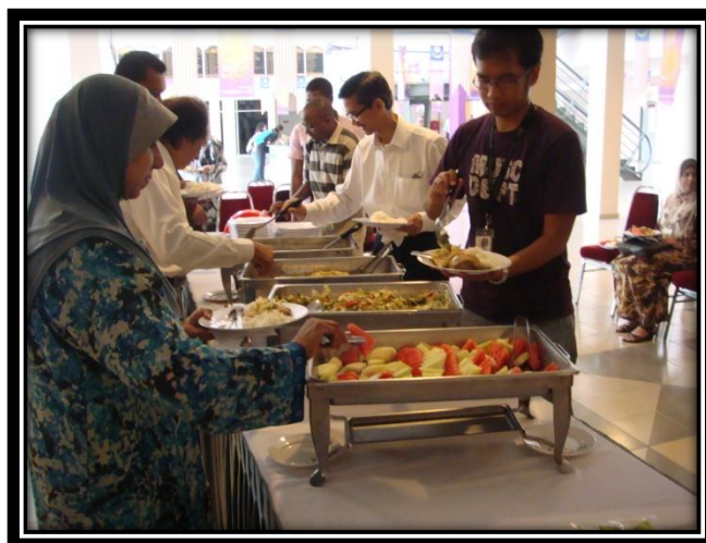
Participants enjoying the lunch spread prepared by the organizers