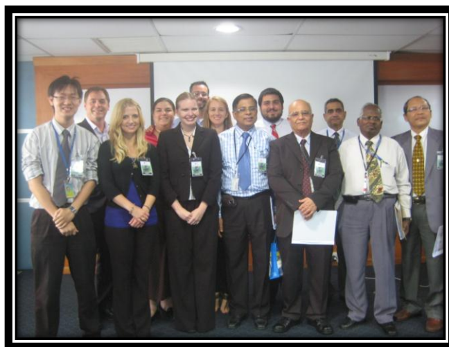
Members of the faculty with guests