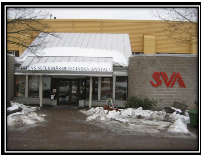
The National Veterinary Institute (SVA), Uppsala Sweden