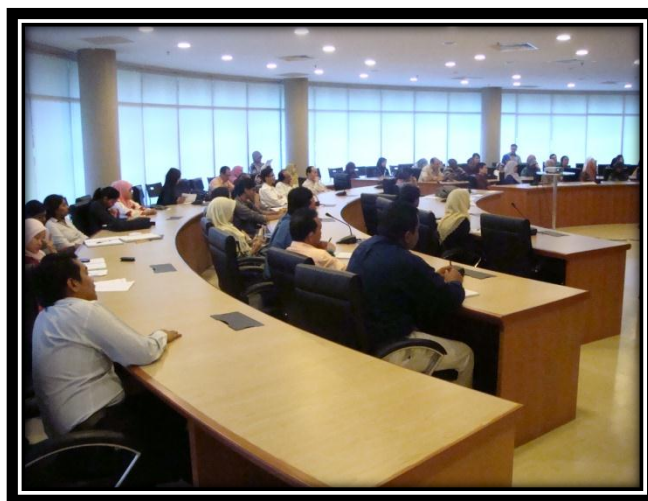
All the participants