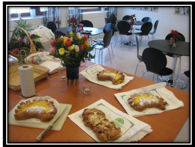
Delicious sticky buns