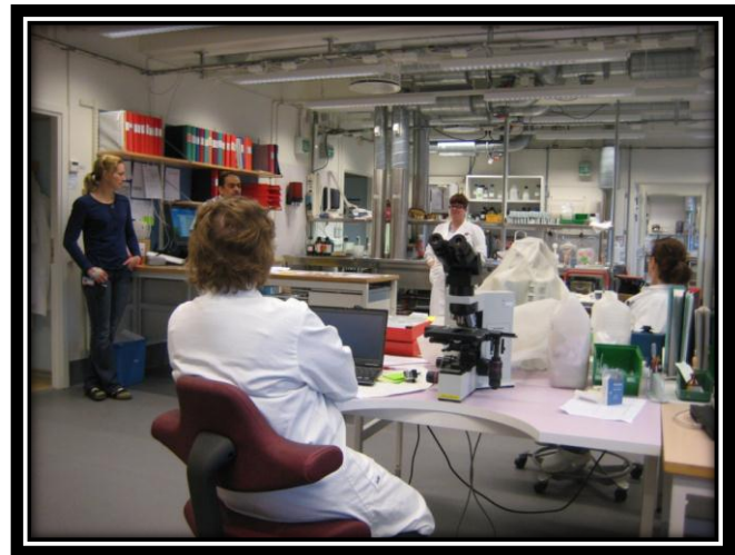
The parasitology lab