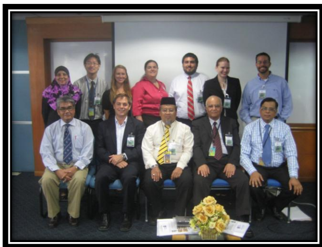
Line up of speakers and participants including postgraduate students from Texas A&M University

There were also 4 PhD students and 1 Master student from Texas A&M University presented their papers in the seminar. The one day seminar was held on 5 th July 2011 at the Lecture Hall 1, Level 6, Tower 1, Faculty of Medicine, Universiti Teknologi MARA (UiTM).