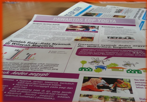
Pamphlets designed to educate and update the public about the progress of the project