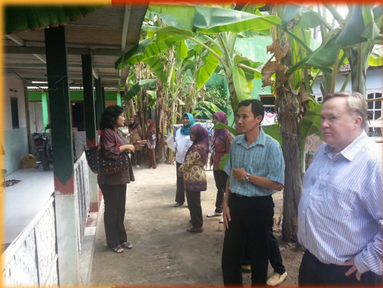
Visit to the households of the study site