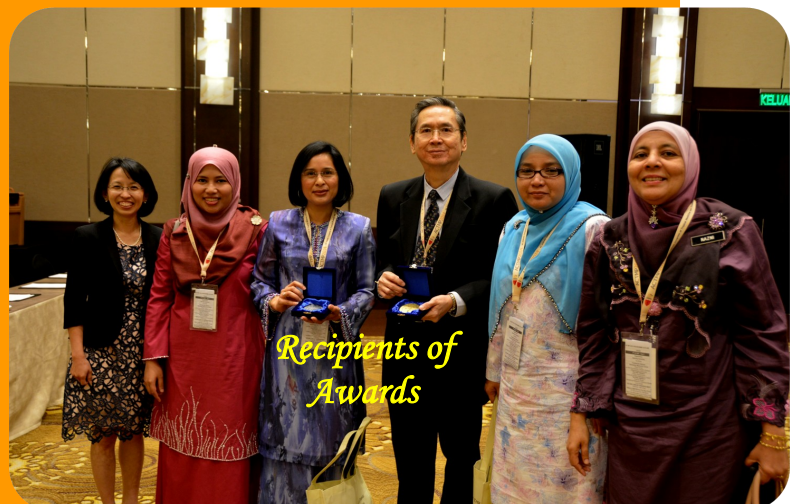
Recipients of Awards