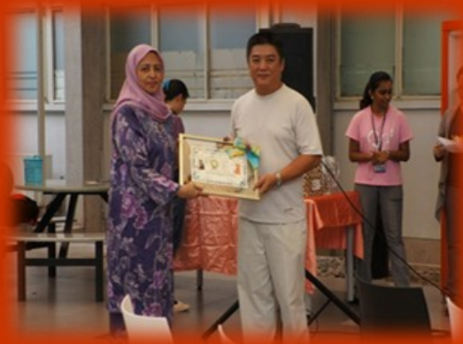
Recognition - PAWS

Issues on street animals have been plagued in our society without much benefit to them. The urgency to improve their well-being is un-compromised. Animal awareness day (AAA), the non-profit and charitable event, has been initiated since 2013 by Department of Parasitology, Faculty of Medicine, University of Malaya. AAA, one of the department's activities, serves as a platform in not only striving to be the best in academic performance but also in steering to be the fore-front in social responsibility. AAA is the first of its kind that has been organized at the level of higher learning institutions outside veterinary compound in Malaysia. AAA aims to spread the awareness of kindness to animals in our own campus, to encourage students to be a part of this social engagement, to recognize animal welfare and any individual of his/her perseverance and commitment toward the better well-being of street animals and to raise funds for medical and neutering assistance to a selected organization.