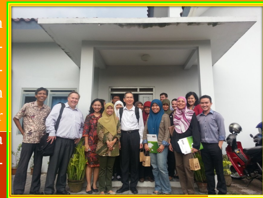
The EDP team