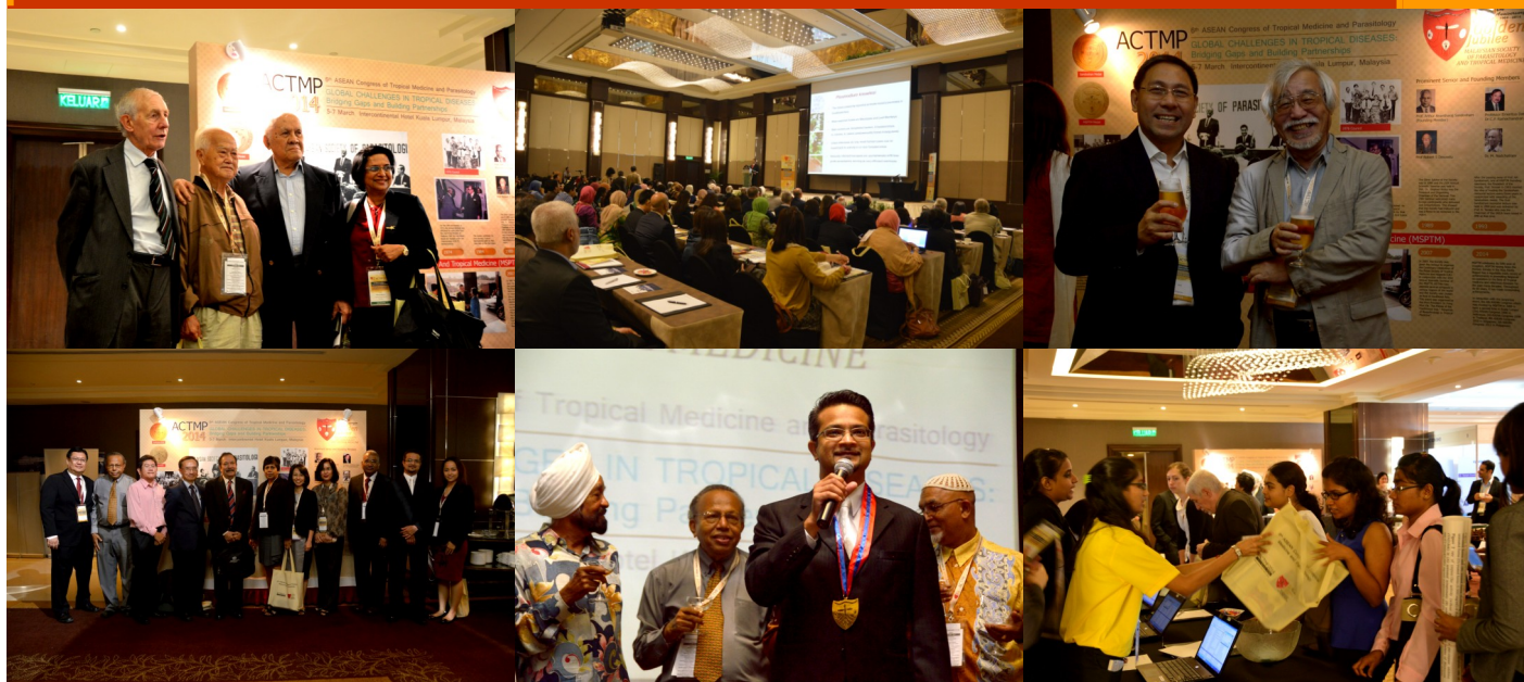
Some Memorable Photos from ACTMP 2014

On the whole, to mark the Golden Jubilee of MSPTM we are glad to announce that the Congress was a great success and the best the Society has ever had with so many prominent scientists from the region and the world presenting at this prestigious occasion.