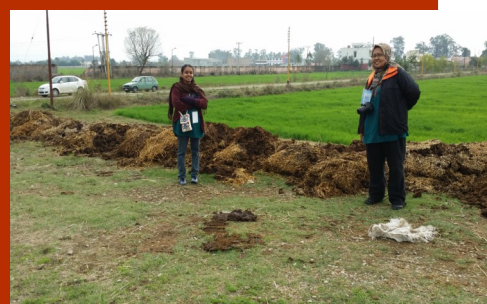
Some side seeing pictures from Kashmir