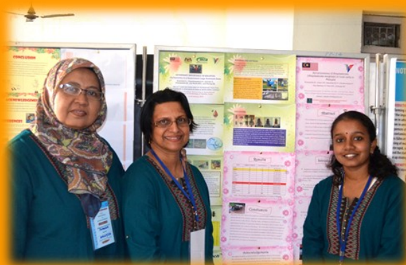
VRI Team with their poster presentation.

The Indian Society for Veterinary Medicine (ISVM) and Division of Veterinary Medicine Faculty of Veterinary Sciences & A.H. Sher-e-Kashmir University of Agricultural Sciences @ Technology of Jammu, India organized the XXXII Annual Convention of The Indian Society for Veterinary Medicine (ISVM) & International Symposium. The theme for this year was 'The 21 st Century Road Map for Veterinary Practice, Education and Research in India and Developing Countries'. There were about 350 participants from various countries. India had the largest number of participants with 4 participants from Malaysia. There was a wide range of topics presented: Dairy Animal Production Medicine, Companion Animal Medicine – Internal Medicine and Specialities, Small Ruminant Medicine, Equine and Park Animal Medicine, Avian and Exotic Species Medicine, Biotechnological development in Animal Health and other diseases. There were also 45 poster presentations of various topics on Veterinary Medicine.