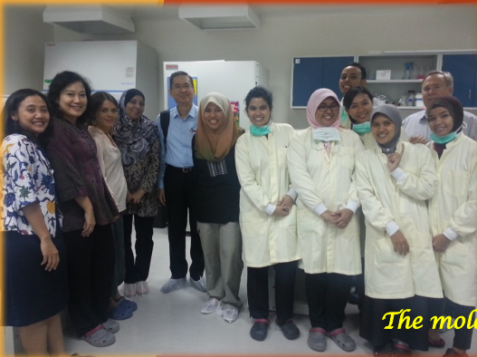
The molecular laboratory in University of Gadjah Mada